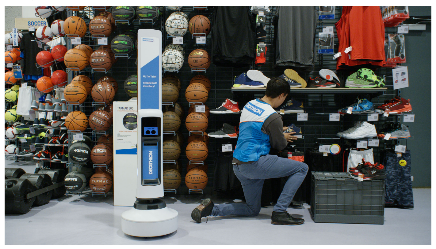
Tally alerts store associates to out-of-stock items so they can quickly refill empty shelves.

in parallel along with strong ROS support and supply chain reliability all led to Intel RealSense depth cameras being evaluated as a strong fit in all categories of consideration.